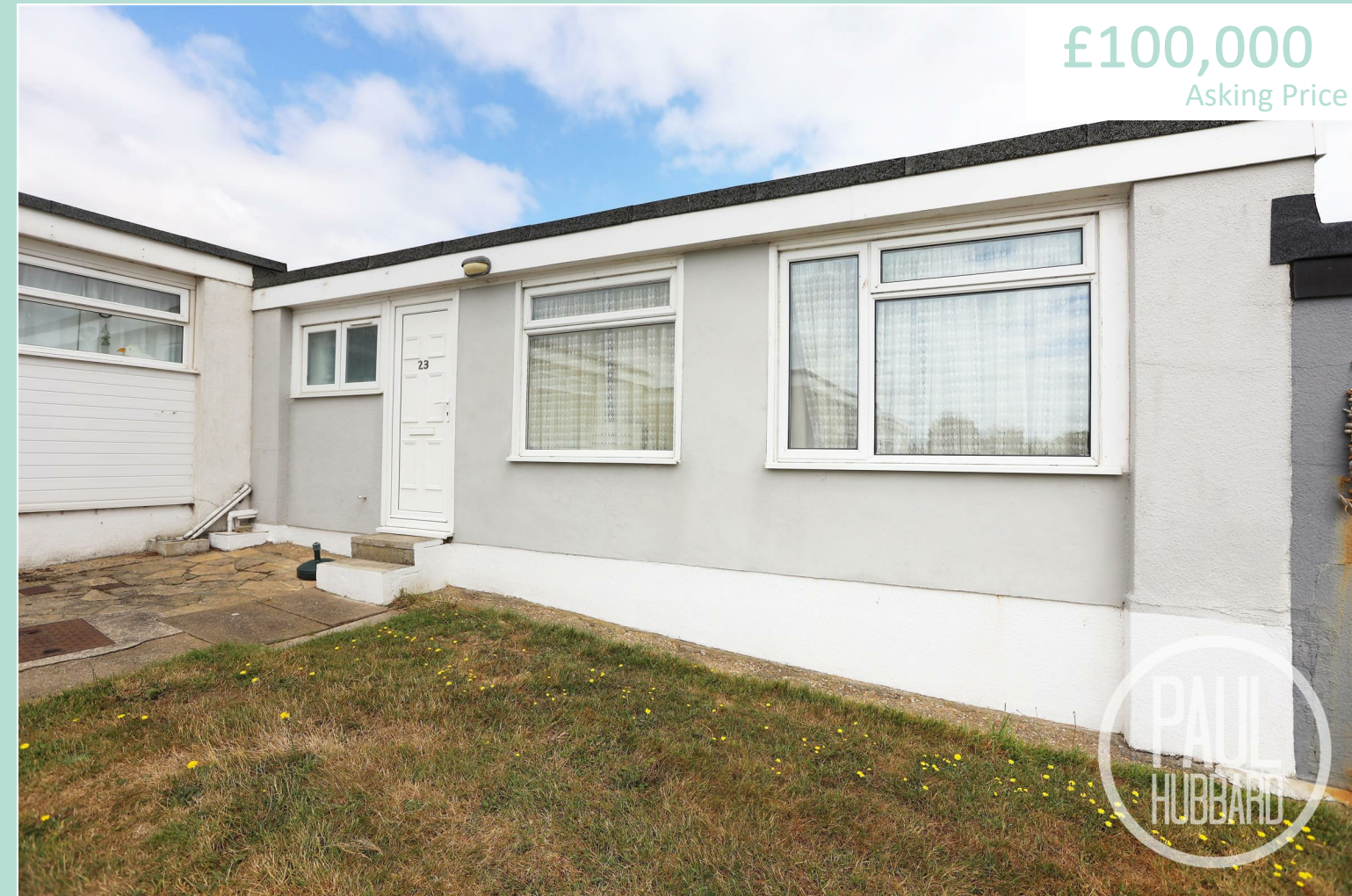
SEAVIEW CHALET 501 sq.ft. (46.6 sq.m.) approx.